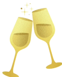
Eglantina Aguirre Caregiver